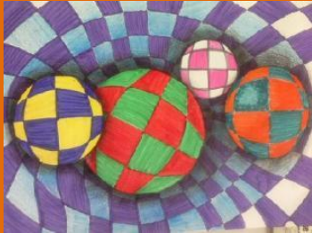
Finished Op Art work

Students in Mr. Rudy Begay's 3 rd -8 th grade art classes at Capitol are learning about Op Art which was very popular in the 1960s and 70s. Op art dazzles the eyes with optical illusions. To create their artwork students use protractors, to make arcs, vertical and horizontal lines, tick marks, spheres, and 2D/3D checkerboard effects to design global spheres on a 2D surface. The students are fascinated with the assignment.