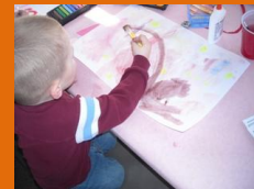
Three year old artist and future PESD student