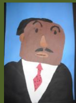
Portrait of MLK Jr.