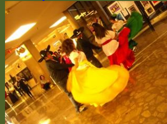
Folkloric dancers from Edison