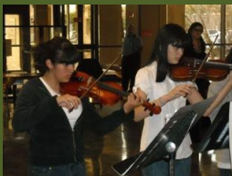
Violinists from Herrera

The artwork of students from each of our schools is on display at the Arizona State Capitol in celebration of Martin Luther King Jr. Day and African American History Month. The show opened with a reception on January 25 and will run through February 2, so if you missed the opening there is still time to get out and see our wonderful student work.