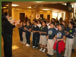
Student artwork and Capitol choir