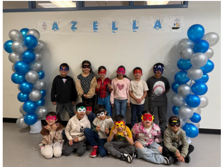
Our AZELLA Super Heroes!